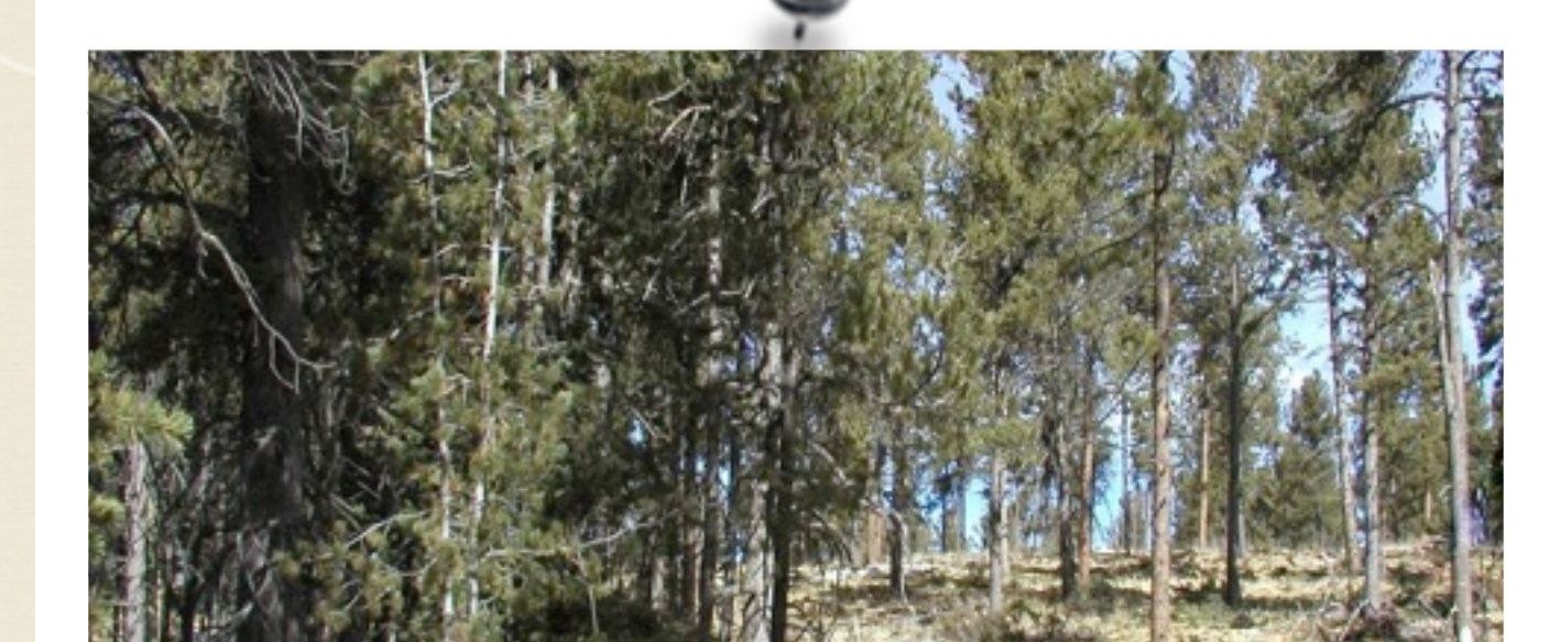
BEFORE Fuels Reduction

Not only does defensible space surrounding your home protect your own property, when created with your neighbors, defensible space helps protect your community, your forests and your watershed.